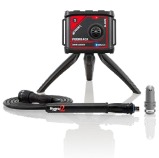
Product order code: FBSK5.1

The Tramex Feedback DataLogger and App have been designed and developed by Tramex for professionals who depend on accurate, reliable readings using the very best, state of the art technology and performing AS/NZ 2455, 1884 & BS 8201, 8203, 5325 & ASTM F2170. The Feedback DataLogger and App log up to 100,000 data point entries for relative humidity, temperature, dew point and grains per pound, transmitted wirelessly via Bluetooth BLE technology to your mobile device. On the App you can visualise Live Readings, Thermal Conditions and Psychrometric Charts, as well as creating and exporting spreadsheets, charts and reports. The Tramex Feedback DataLogger requires the Tramex Feedback Data Logger App and a compatible iOS or Android mobile device.