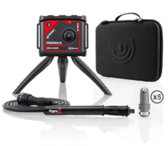
Product order code: FBZK5.1

The Tramex Feedback DataLogger and App have been designed and developed by Tramex for professionals who depend on accurate, reliable readings using the very best, state of the art technology and performing AS/NZ 2455, 1884 & BS 8201, 8203, 5325 & ASTM F2170. The Feedback DataLogger and App log up to 100,000 data point entries for relative humidity, temperature, dew point and grains per pound, transmitted wirelessly via Bluetooth BLE technology to your mobile device. On the App you can visualise Live Readings, Thermal Conditions and Psychrometric Charts, as well as creating and exporting spreadsheets, charts and reports. The Tramex Feedback DataLogger requires the Tramex Feedback Data Logger App and a compatible iOS or Android mobile device.