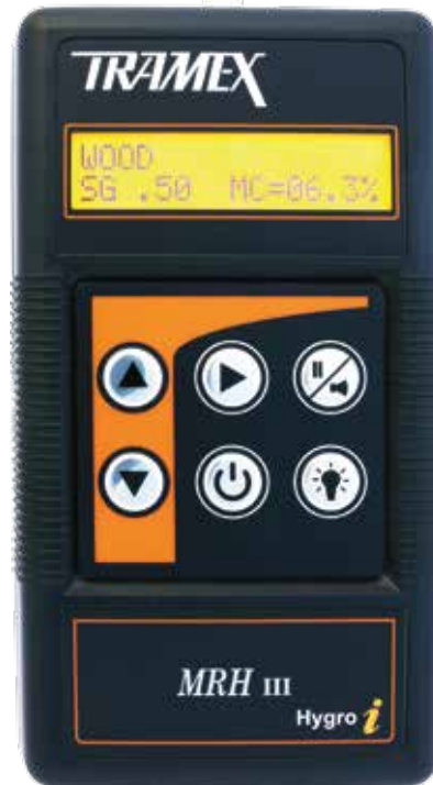
Product order code: MRH3

The Moisture and Relative Humidity MRH III is a hand-held digital moisture meter calibrated for most building materials. It also incorporates optional plug-in heavy-duty pin-type wood probes and Hygro-i® probes for measurement of relative humidity and ambient conditions and allowing for testing of concrete per ASTM F2170 and F2420 (with optional sleeves or hood). Suitable for many industries including Flooring, Water Damage Restoration, Indoor Air Quality, Home Inspection and Pest Control.